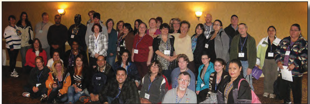
Learner Retreat 2013 was an exciting opportunity for adult learners from across Nova Scotia to meet each other and experience inspiring guest speakers and engaging workshops.