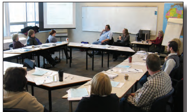
LNS board & staff attended a strategic planning session in January 2014.